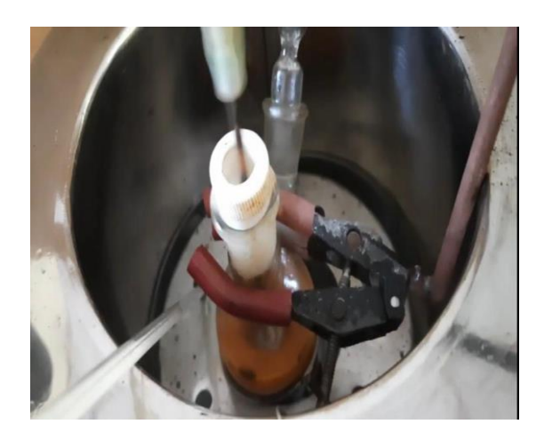
Fig. : Experimental setup for epoxidation of fish oil.

dried over anhydrous MgSO4 and the solvent removed under reduced pressure to give yellow oil (1.66 g).