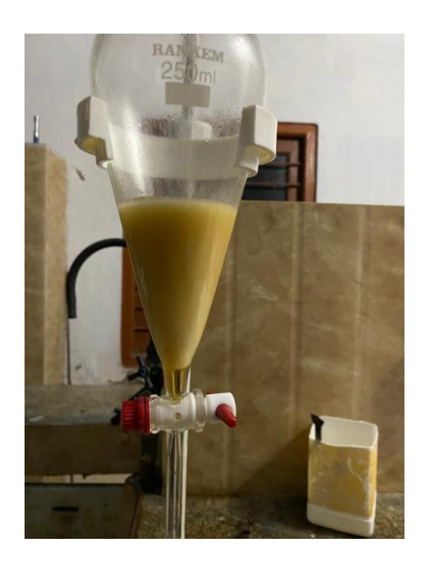
Fig: Synthesized epoxidized fish oil.